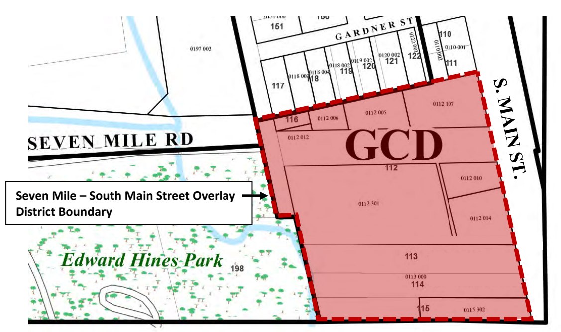
Figure 1. Seven Mile – South Main Street Overlay District Boundary